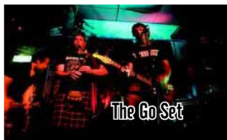
The Go Set